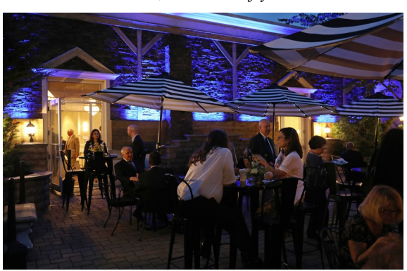
Guests enjoyed dinner outside under the stars.